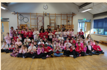
Brimington Junior school dance workshop

Our biggest event to date as we celebrated our 40th year in supporting our community. We held our Diwali celebrations at the Winding Wheel Theatre in Chesterfield.