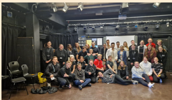
Chesterfield College dance workshop