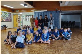
Holmehall Primary dance workshop