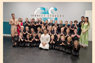
Connect Studios dance workshop