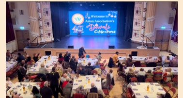
Diwali 40th Anniversary Celebrations at Winding Wheel Chesterfield