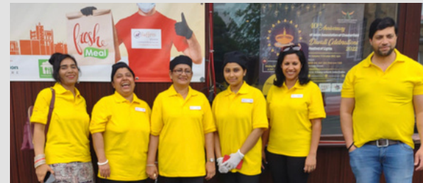
Our Saffron Kitchen Team outside of the Asian Association Centre.

Saffron Kitchen was an idea that finally came to life during the pandemic in 2019, an opportunity to support vulnerable people who were unable to leave their homes. As the world came back to normal, Saffron Kitchen opened its doors to regular meal days, cooking classes and catering events.